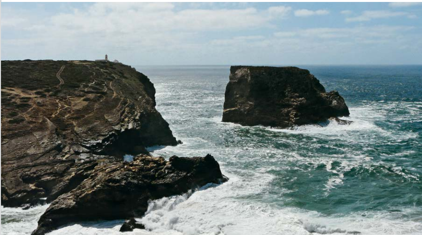
The steep coastline at Cabo de São Vicente.

ascends slightly, traversing a kind of high plain, lying in the coastal hinterland. Along this somewhat monotonous path, continue on to reach a little hamlet, seemingly abandoned, Vale Santo (3) . Here, meet up with a trail junction. Take the waymarked trail to the right along a broad dirt road. At the crest, this begins a slight ascent. After passing a small pine forest, lying to your left, meet up with a trail junction (4) . Here, once again follow the also white/red waymarked Rota Vicentina via a narrow dirt path by turning left and entering a mostly uninhabited area. Solitary houses appear, otherwise, the landscape is characterized by fields and meadows. Just past the first white house, the path forks off to the left and passes impressive stands of agave. A little later on, fork off to the right and follow a narrow dirt path that soon becomes a sandy, stony trail, ascending slightly. Soon meet up with yet another trail junction (5) . To the right, the trail leads along the Rota Vicentina towards Vila do Bispo. We, however, continue to the left, now following the green/blue waymarkers of the Fishermen's Trail , leading along the coastline towards the Cabo de São Vicente ; the lighthouse there can already be spotted in the distance. A short stretch past the junction, you could turn right to descend to the Praia da Ponta Ruiva. Our route, however, leads along the