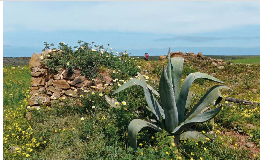
Whilst walking in the Algarve, the walker often meets up with towering agaves.