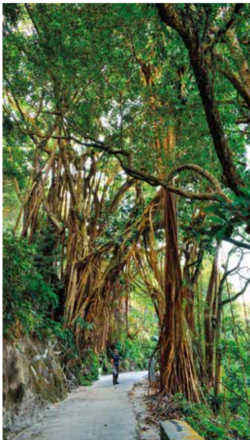
Banyan tree tunnel

It is bizarre to see a 'beware of horse' sign here. This was a bridle path for the British gentry in colonial times, and there is still a riding school nearby.