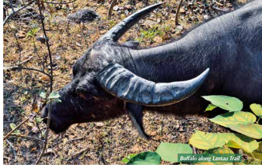
Buffalo along Lantau Trail

A staggering 530 bird species are found in Hong Kong. This is due to its subtropical climate and highly varied environments (coastal, shrublands, woodlands and wetlands), as well as its location on a major migratory