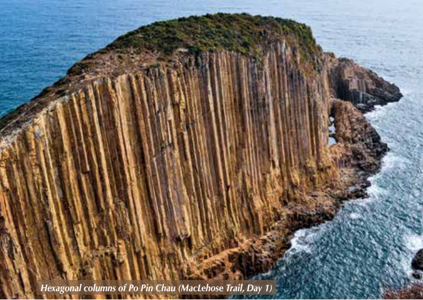
Hexagonal columns of Po Pin Chau (MacLehose Trail, Day 1)

Within a relatively small geographical area, it is possible to climb mountains, walk through mangrove swamps, visit old fishing villages, see wild boar or pangolin, go tropical birdwatching, explore unique geological features, and admire the astounding numbers and varieties of butterflies. There are options to camp on remote beaches for stargazing, or to be whisked off to five-star hotels and eat in Michelin-starred restaurants, should your preference and budget be that way inclined. With the efficient transport system, it is surprisingly easy to leave the hustle and bustle of this international business centre behind, giving hikers easy access to nature.