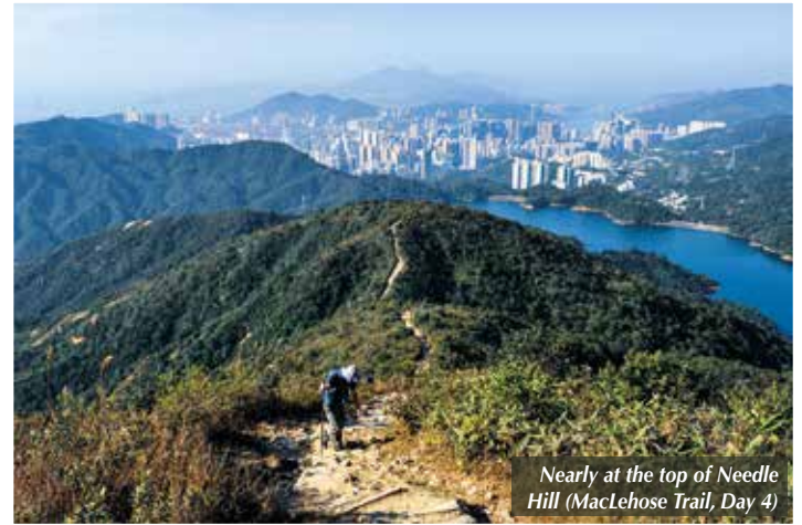
Nearly at the top of Needle Hill (MacLehose Trail, Day 4)

Hong Kong (香港 pronounced Heung Gong, meaning Fragrant Harbour) is simply 'home' to over 7.5 million locals. The name conjures up ideas of a vibrant city of multi-culturalism where East meets West, a foodie haven where it is possible to eat astoundingly well by day and night, an exciting shopping venue for almost anything and, most of all, a densely populated metropolis famous for its skyscraper landscape. It has the highest number of vertiginous buildings in the world, twice as many as New York, but if you think it is a complete concrete jungle, come hiking in Hong Kong and be very pleasantly surprised. The widely