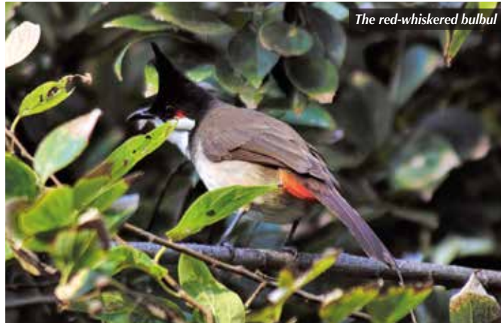
The red-whiskered bulbul

route, the East Asian–Australasian Flyway. Good walks for seeing birds are Lantau Trail, Tai Po Kau (Walk 9) and Po Toi Island (Walk 21).