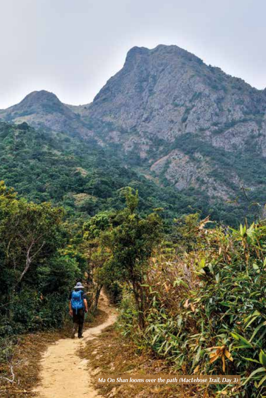
Ma On Shan looms over the path (MacLehose Trail, Day 3)