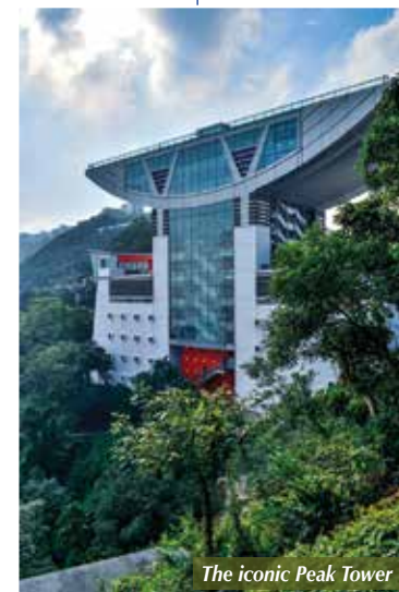
The iconic Peak Tower

About 400 metres from the Peel Rise turn, walk past Pok Fu Lam Reservoir