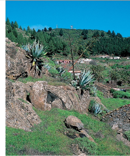
Just before reaching Iqualero.

derful 360° panoramic view. Return along the cobbled road and after 5 mins turn left at the fork and onto the cobbled road towards Chipude (sign). A good 100 m on, reach another fork – turn right here (sign »Chipude – Laguna Grande«), descending along a steep cobbled road while enjoying a fabulous view of the Fortaleza. After about 20 mins, pass the pine forest, Pinar de Argumame (here, two trails fork off to the right). 50 m further on, reach another junction. Here, a forestry road forks to the right and, diagonally right, a signed, hollow way-like trail forks off as well; continue along this one. In a few minutes, this trail becomes a regular roadway, then shortly after, swings to the left and forks – bear right to descend. Soon the roadway becomes a stepped camino passing vineyards and descending to Los Manantiales . Cross over the road and then turn right onto the lantern-flanked camino to continue. At the first house, turn left, descending to an intersecting trail. Continue left along this until, in front of a house, a broad intersecting trail leads to the right descending to the valley floor. On the other flank of the valley, a gently ascending trail continues, bearing right along the slope, and forks 5 mins later (to the right heads to El Cercado). Here left to the ridgeline then descend through a small valley and continue along a cobblestone street down to the church square of Chipude .