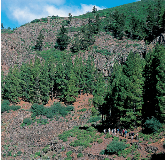
Since the forest fire of 2012, the high trail to Iqualero has lost much of its charm.

pleasant, gentle high mountain walk below the timberline traversing the slope and opening a fantastic view of the Fortaleza. Near a high tension power pylon also catch a downwards view of the hamlet of Erque nestled in the chasm-like barranco of the same name. In easy up-and-down walking with a lovely view of La Dama and the neighbouring islands of El Hierro and La Palma, traverse the slope. Only after passing the third power pylon (a good ½ hr) does the trail become somewhat steeper. 5 minutes later the trail forks – here turn left (straight on, the GR 132.1 to Erquito branches off). Our camino now climbs through overgrown terraces to the village street of Iqualero (10 minutes), ascending to the main road (10 minutes; bus stop shelter for lines 1, 6).