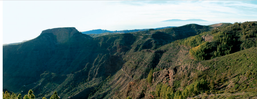
View from Mirador de Iguale-ro of the high mountain trail and to Fortaleza; La Palma in the background.

left continues on parallel to the road and leads to the hamlet of Apartadero then merges with the road again. Past the Los Camioneros bar and after a sharp right-hand bend (or via the camino through the barranco ) reach the hamlet of Pavón . 20 m after the transformer tower on the side of the road, a cobblestone street ascends to the left and ends just before a small gentle valley notch. Here right through the notch climbing to the Fortaleza Saddle , 1125 m, to reach a fork in the trail (to the right a possible excursion onto the Fortaleza, →Walk 18).