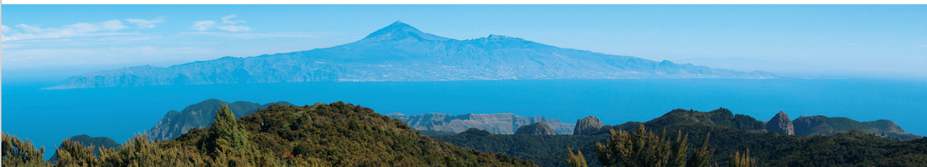
From Garajonay, you can enjoy a splendid view of Tenerife when weather is clear.

forest fire of 2012. After 10 mins, meet a forestry road – follow this to the left via the GR 131. After a few minutes, another forestry road merges from the left into ours then a quarter of an hour later another forestry road coming from Chipude merges sharply from the left (the return route later on). A good 100 m later reach another track forking off (the cobbled road forking left leads to the mountain road with the car park, Alto del Contadero; to the right to the Garajonay summit). We follow the cobbled road 20 m to the right and then turn left onto a path that forks shortly after – turn right here crossing the ridge to ascend to the overlook platform at Garajonay ; when weather permits enjoy a won-