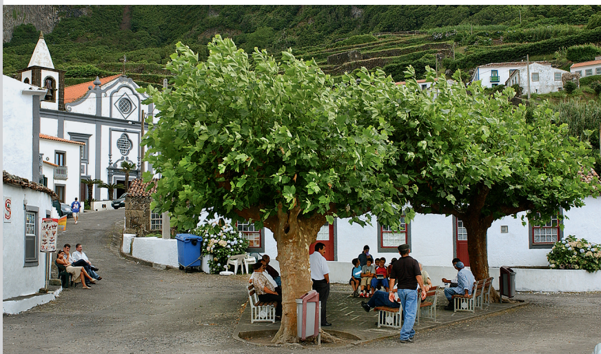
The village centre of Fajãzinha at the Rossio square.

Start off at the little chapel below the old schoolhouse in Costa do Lajedo by descending along the narrow street for a few strides towards the coast. Just when meeting up with the old milk collection point, turn right onto a dirt trail which at first ascends to the massif Rocha do Pico but then descends again. A good 15 mins. later, the trail becomes a tarmac road. Just before this happens, however, turn left onto a grassy trail. The trail leads into the valley of the Ribeira do Campanário which we cross over below Lajedo. A cobblestone trail climbs up to the street where we turn left and then reach the village centre of Lajedo (40 mins.).